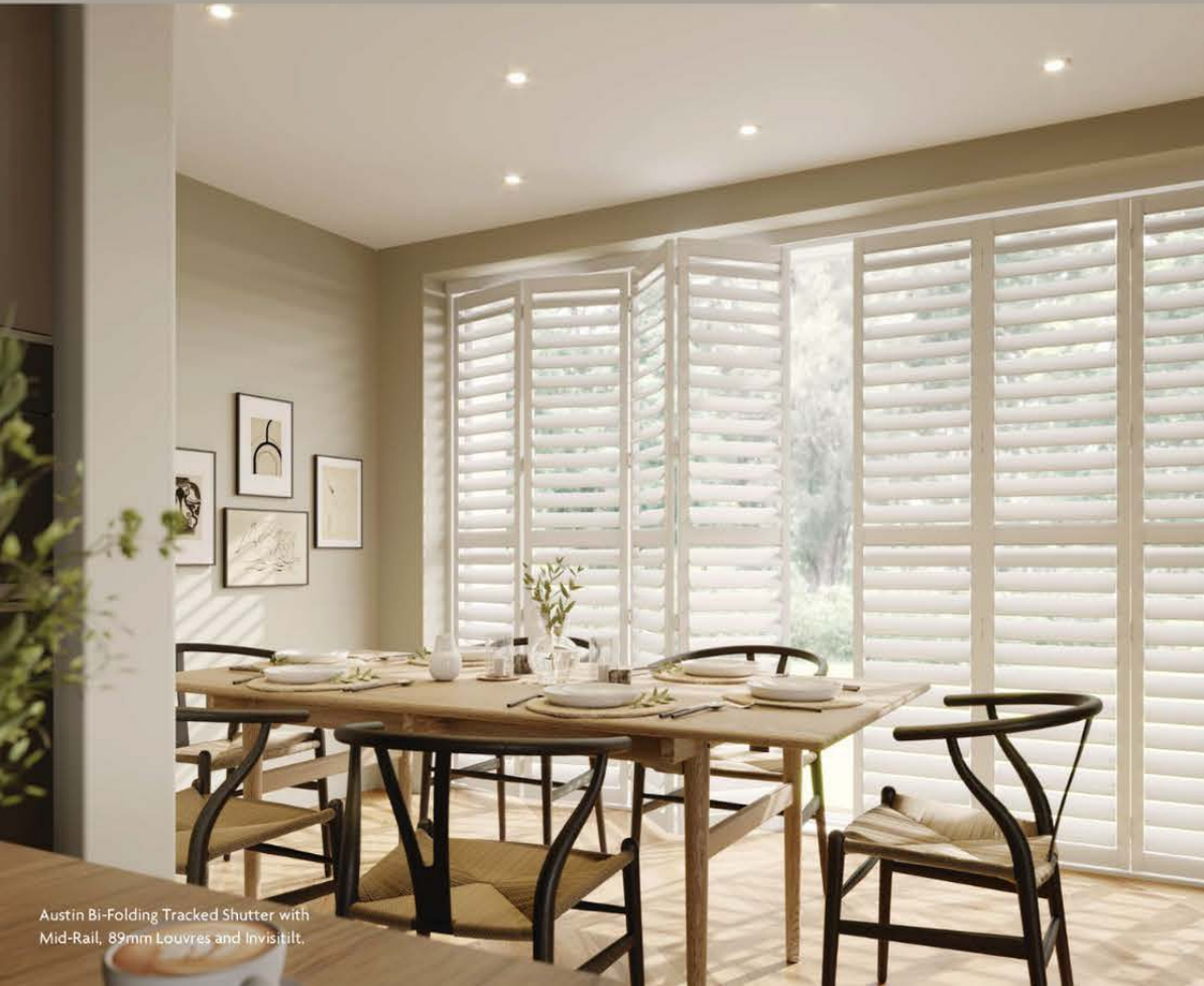
Austin Bi-Folding Tracked Shutter with Mid-Rail, 89mm Louvres and Invisitilt.

Tracked shutters can also be used as a stylish and versatile room divider.