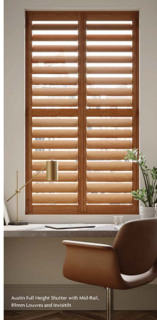
Austin Full Height Shutter with Mid-Rail, 89mm Louvres and Invisitilt.

Sustainable: Paulownia wood is a fast-growing species that is sustainably harvested, making it an eco-friendly choice for those looking to minimize their impact on the environment.