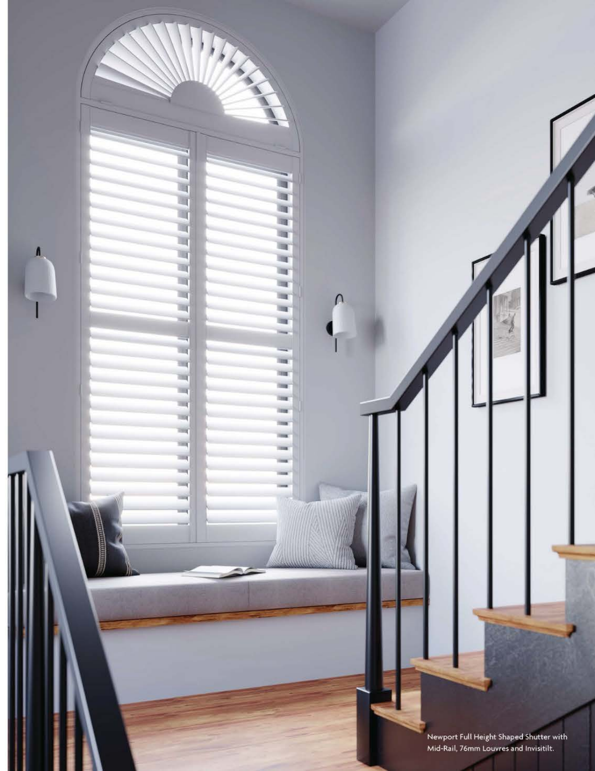
Newport Full Height Shaped Shutter with Mid-Rail, 76mm Louvres and Invisitilt.