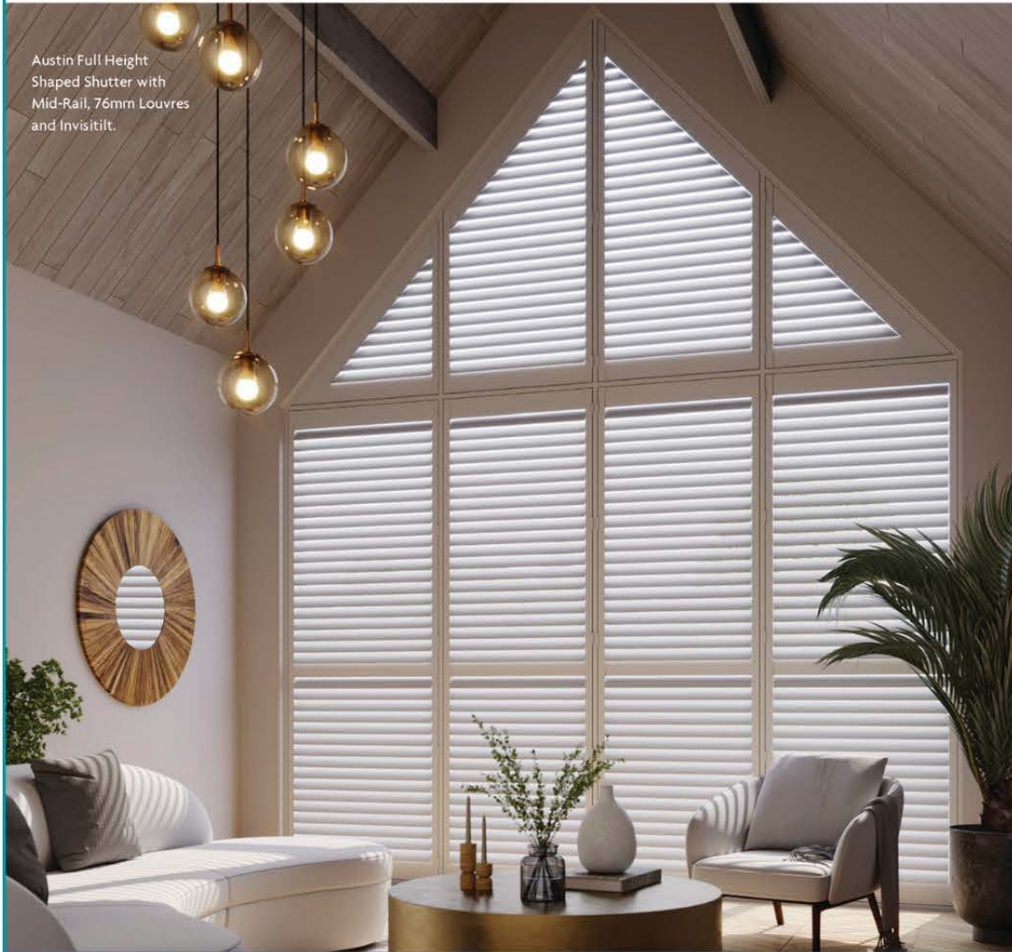
Austin Full Height Shaped Shutter with Mid-Rail, 76mm Louvres and Invisitilt.

Whether large or small, traditional or modern, square bay or curved bay, rectangular, square or shaped, all windows are catered for within our comprehensive portfolio of shutter products. Any shape is available in our Austin and Newport hardwood shutter range.