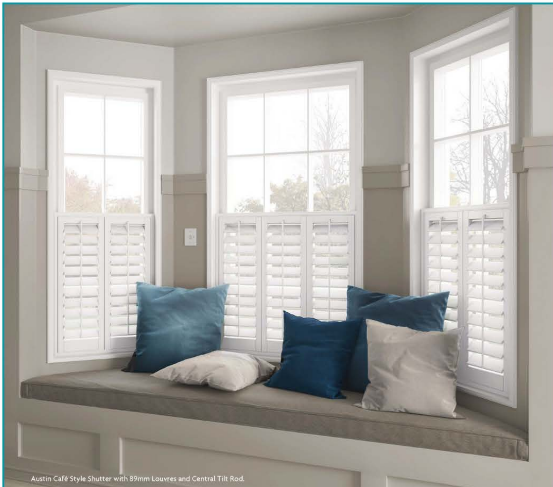
Austin Café Style Shutter with 89mm Louvres and Central Tilt Rod.