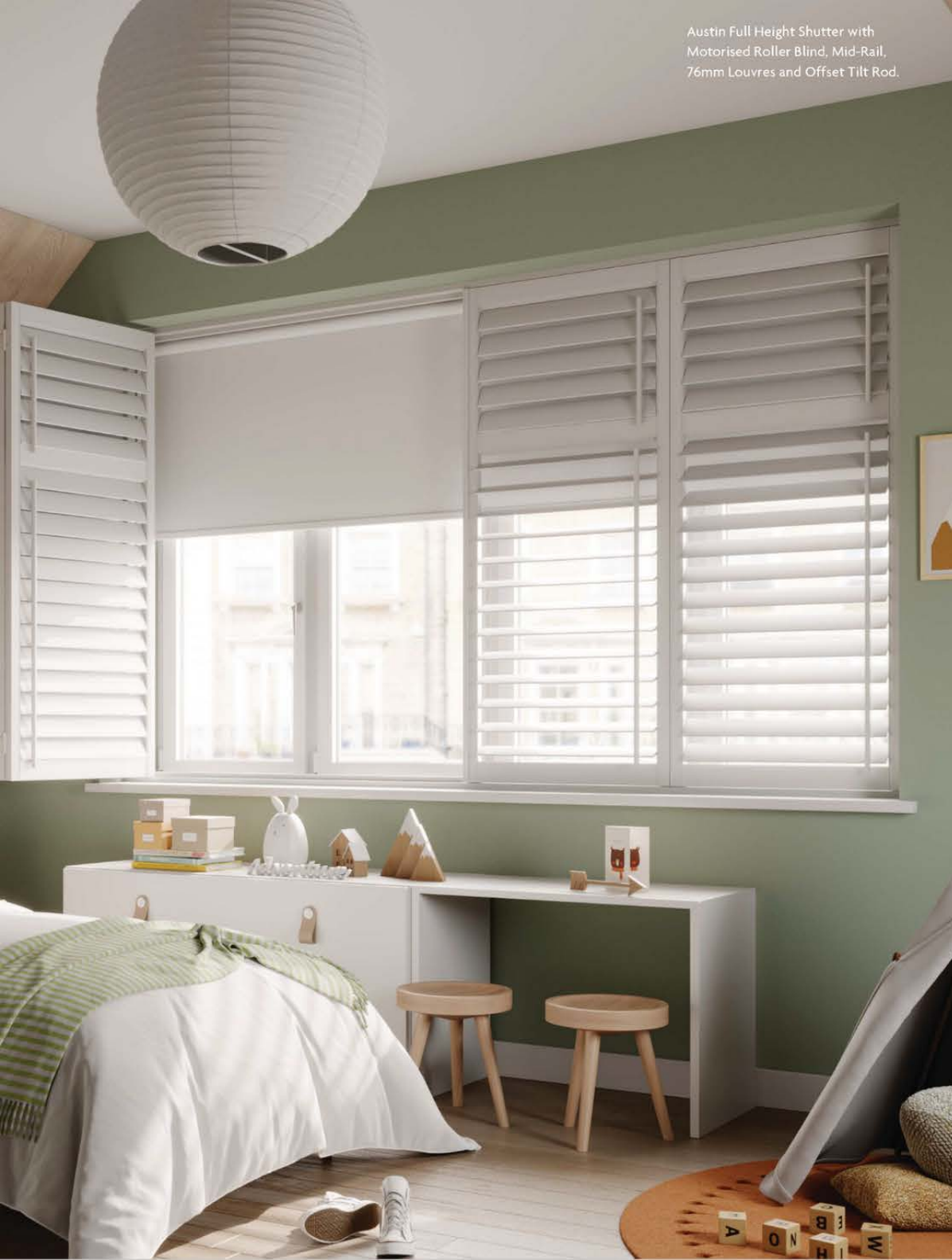
Austin Full Height Shutter with Motorised Roller Blind, Mid-Rail, 76mm Louvres and Offset Tilt Rod.