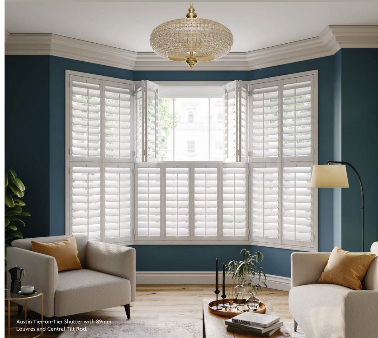
Austin Tier-on-Tier Shutter with 89mm Louvres and Central Tilt Rod.

Tier-on-Tier shutters cover the whole of the window but feature top and bottom panels which open independently of each other. These popular shutters enable versatile control of light and privacy in the daily use of your shutters.