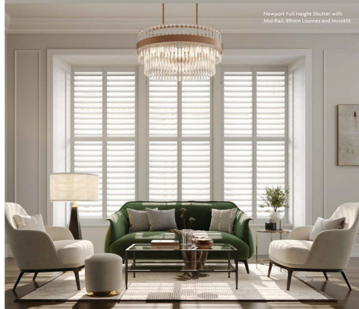
Newport Full Height Shutter with Mid-Rail, 89mm Louvres and Invisitilt.

Newport is available in a wide range of paint colours, including custom colours.