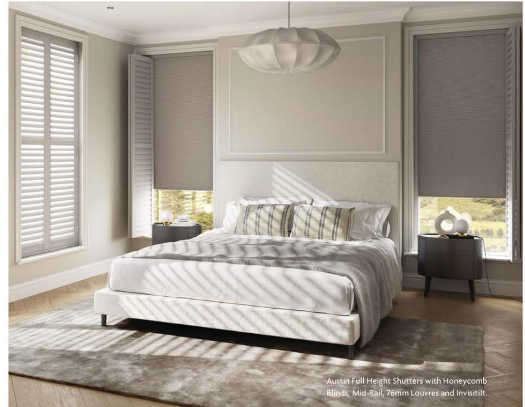
Austin Full Height Shutters with Honeycomb Blinds, Mid-Rail, 76mm Louvres and Invisitilt.