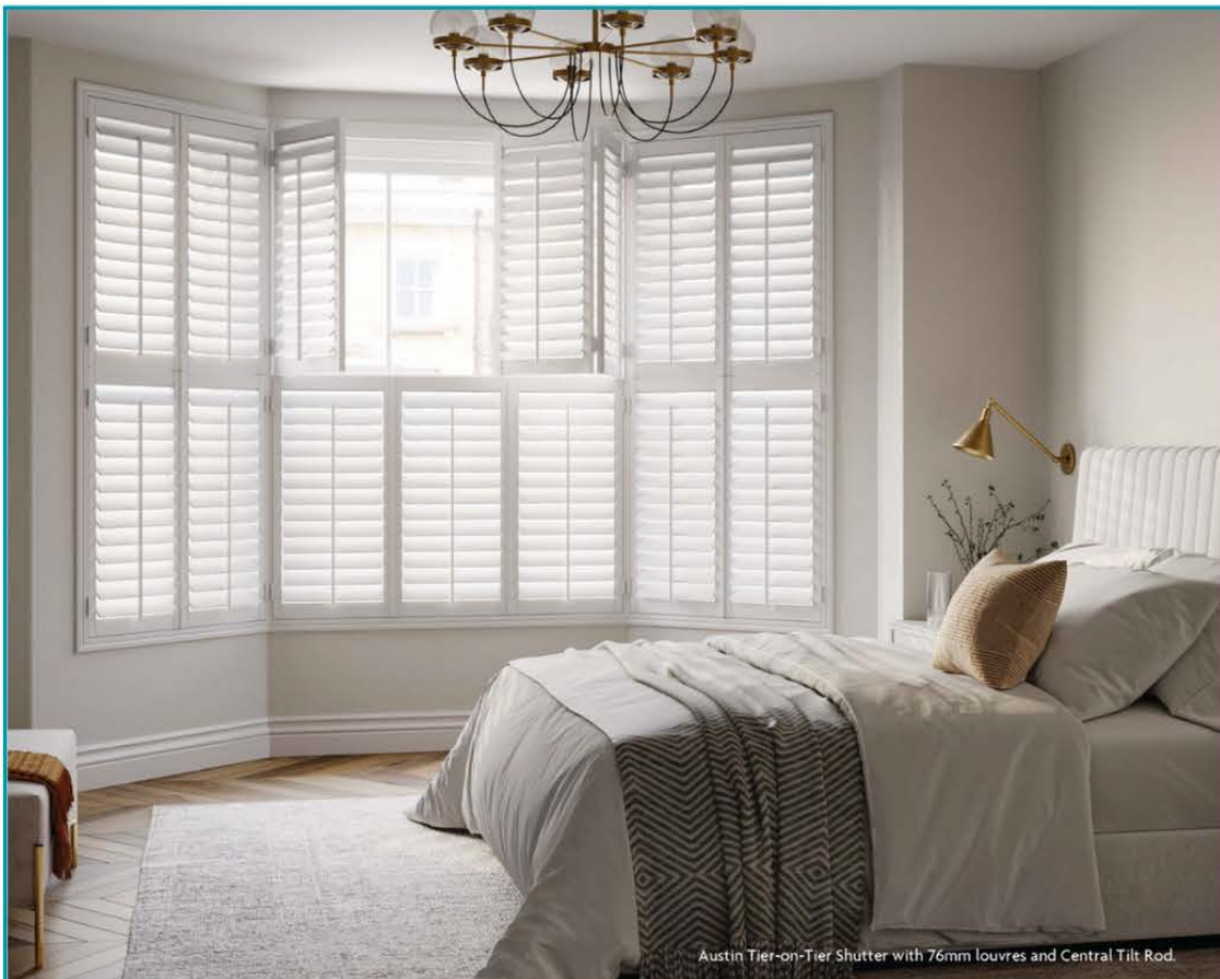
Austin Tier-on-Tier Shutter with 76mm louvres and Central Tilt Rod.